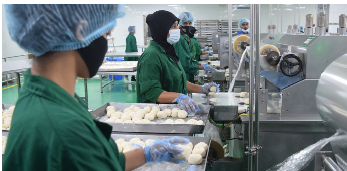
Working after skills training

mote the introduction of internships, apprenticeships, off-the-job skills training, upskilling and reskilling to ensure people better chances to keep up with changes in the labour market.