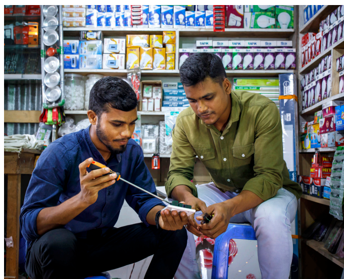
Learning new skills.