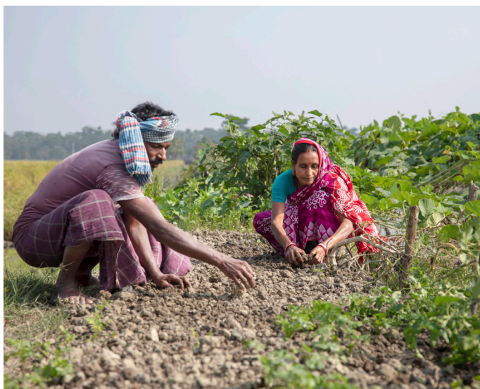
Farmers adapt their practices.