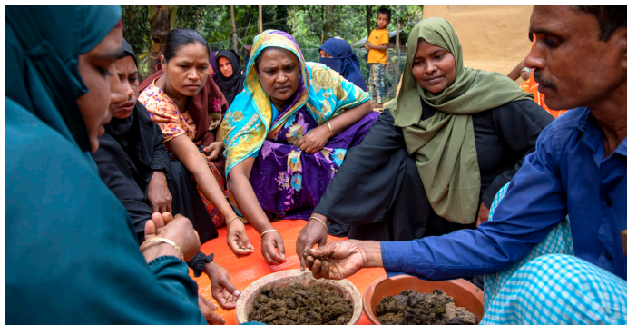
LSP explaining compost production.

We aim to foster sustainable economic growth by building on our extensive experience in value chain promotion and skills development. Helvetas assists farmers in reducing vulnerability to disaster and climate change by strengthening their resilience through additional income generating activities, portfolio diversification, and risk transfer mechanisms. We encourage the adoption of climate-smart technologies , related information, and adaptation measures to avoid and mitigate climate and disaster risks.